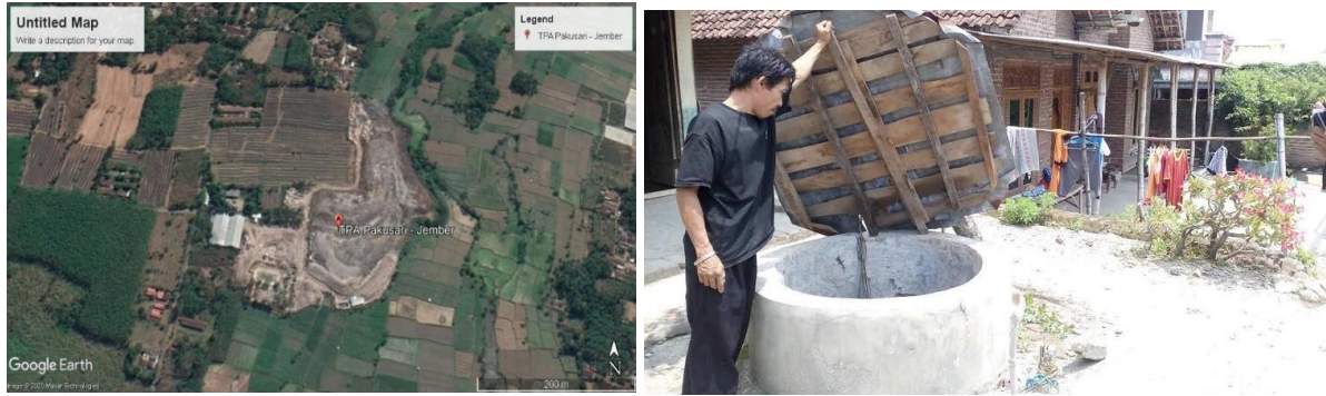
Figure 2. Potential leachate distribution and well monitoring conditions in the field