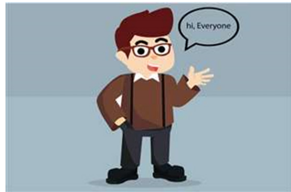
Figure 3: Example of the tracing result for main character.

Script was composed after collecting the material then poured into storyboard on paper. The storyboard consists of 12 scenes. After that, the process of tracing was conducted by using CorelDraw software. As the back sound of the video entitled “sunset” that is taken from open-source link with free license. Figure 3 is the example of tracing result for the character.