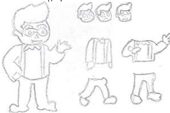
Figure 2: The concept of the main character.

This stage was started from preparing the concept. As stated from the beginning that the purpose of this product is to develop motion graphics to be used as media for speaking practice. Firstly, main character was decided and designed, then followed by audio selection, composing script and storyboard. Main character developed in this product, namely Bobby. The character was the speaker to explain the content of the video. Some additional characters were also created to complete the scene in this video. Figure 2 shows the concept of the main character for this motion graphics.