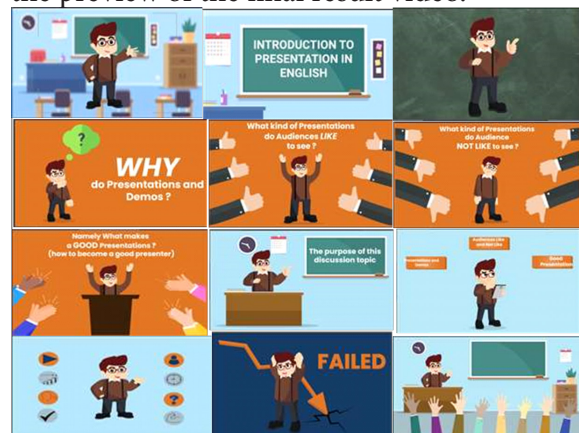
Figure 4: Final result of product development

At the compositing phase of and animating, all assets 2D vector was animated using Adobe After Effect based on the composed scene. At the editing stage, the animation has been made in every scene brought to the rendering stage to be made in .mp4 format. Back sound and dubbing also were inserted in this stage. Figure 4 shows the preview of the final result video.