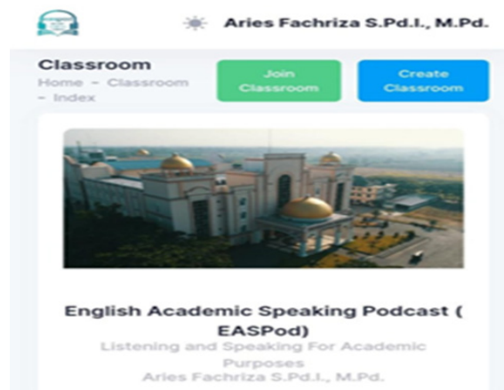
Figure 1. EASPod display in computer

activities that emphasized to students' fluency and pronunciation (Baratova, 2023). This will assist the listener to identify the word or sentence by podcaster.